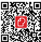
Dipet Life App

Search "Dipet Life" in App Store or Google Play. Download it and sign in.