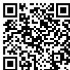
Scan code for tutorial