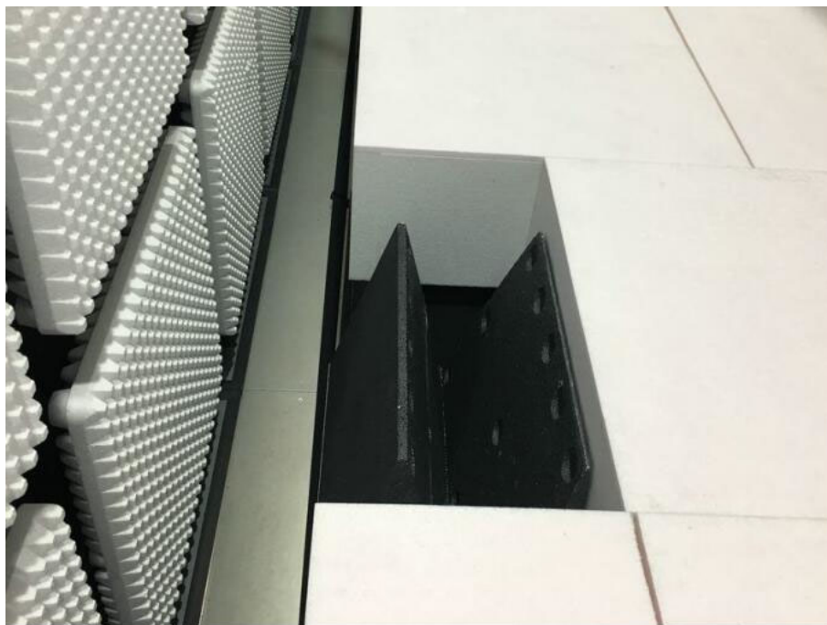
Radiated spurious emission Test Setup-2(Above 1GHz) There are absorbing materials under the ground.