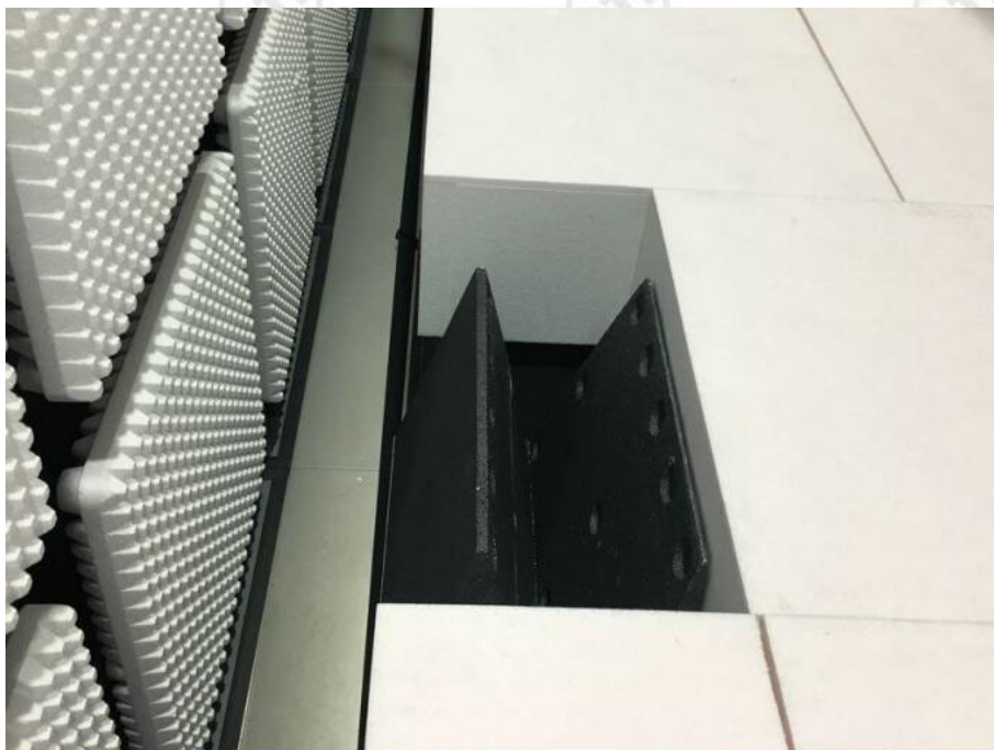
Radiated spurious emission Test Setup-2(Above 1GHz) There are absorbing materials under the ground.