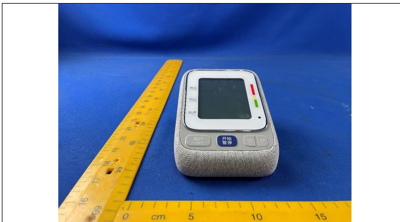
Details of: External view 2 of main unit (M/N: FC-BP110)