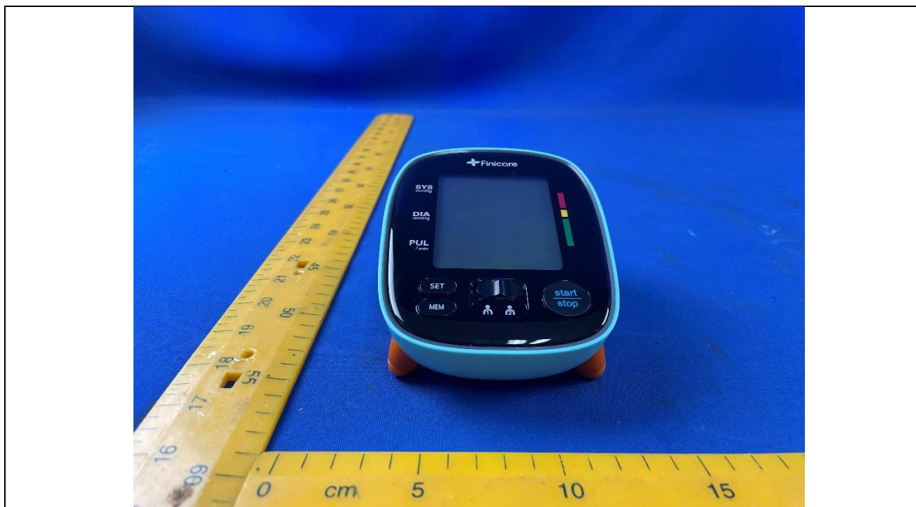
Details of: External view 2 of main unit (M/N: FC-BP100)