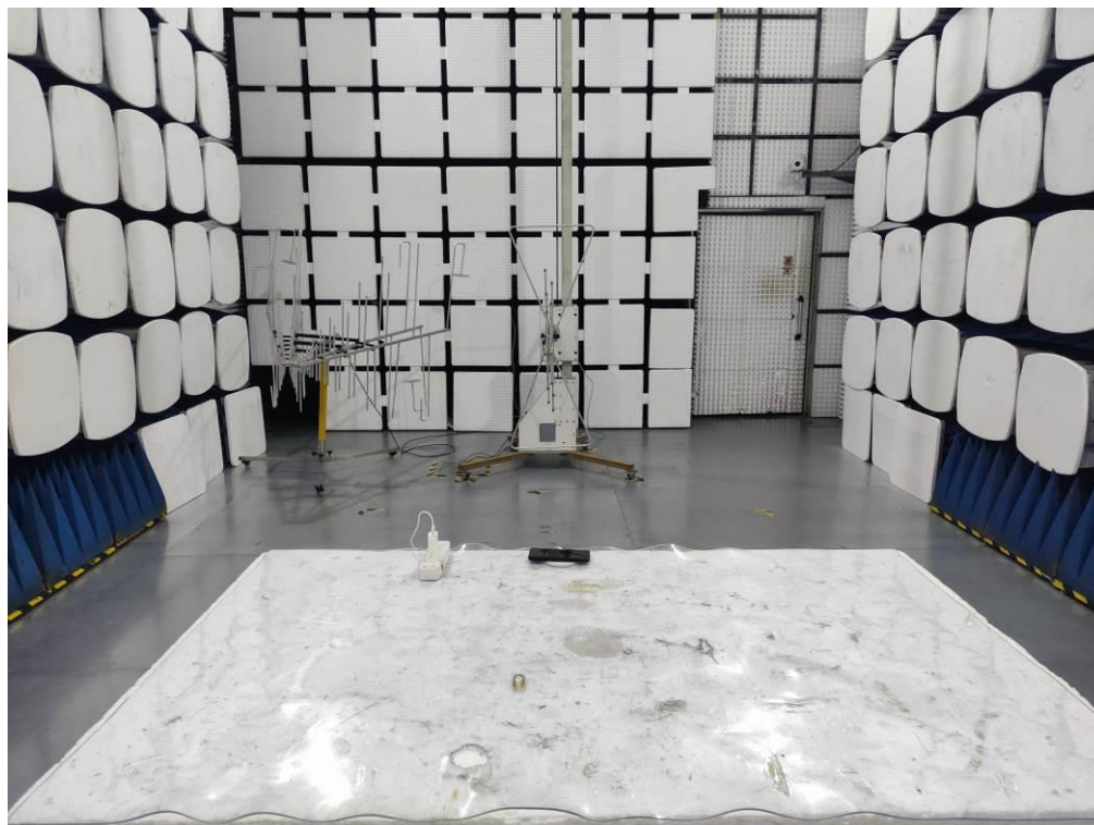
Radiated Emission below 1GHz-AC adapter charge mode