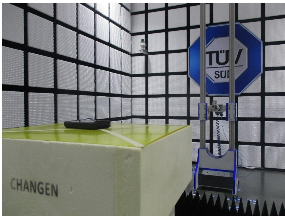
Radiated Spurious emission Above 18 GHz