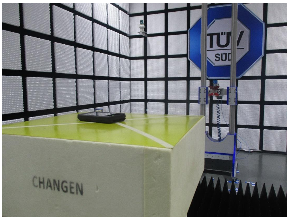
Radiated Spurious emission 1GHz - 18 GHz