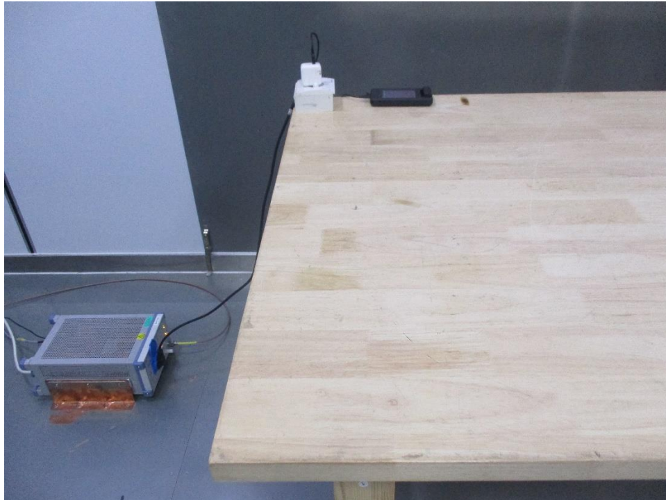
Conducted Disturbance Emissions on AC mains