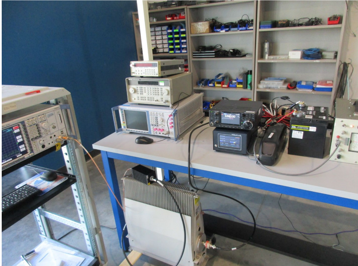
Conducted Test Setup

KM3KM Electronics LLC Model: Mercury Lite FCC ID: 2A3P6MERCURLITE