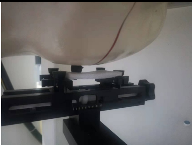
Left Head Check Gap