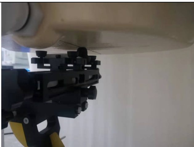
Body worn(Left ear) 0mm Gap