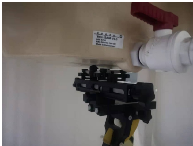
Body worn(Right ear) 0mm Gap