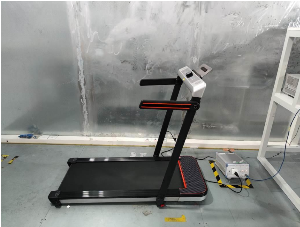
AC Conducted Emission of charge from power adapter mode