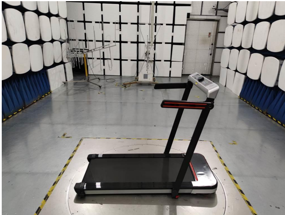
Fig. 1 (Below 1GHz)