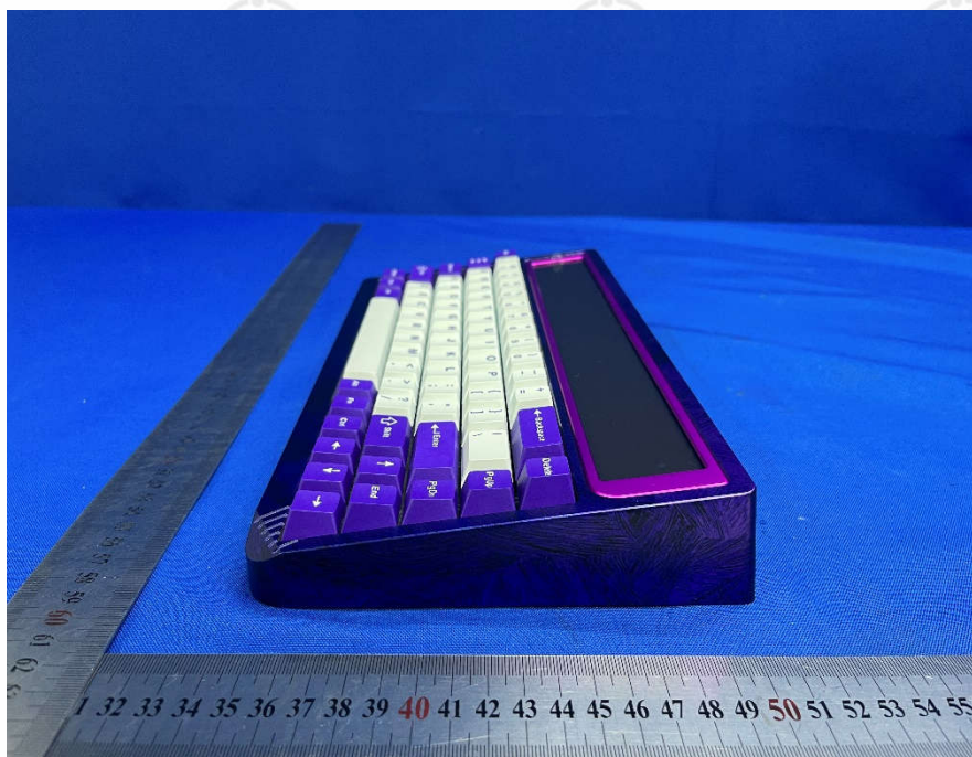
View of Product-04