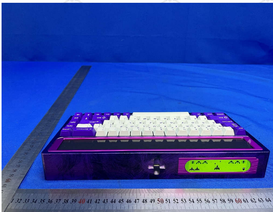
View of Product-06