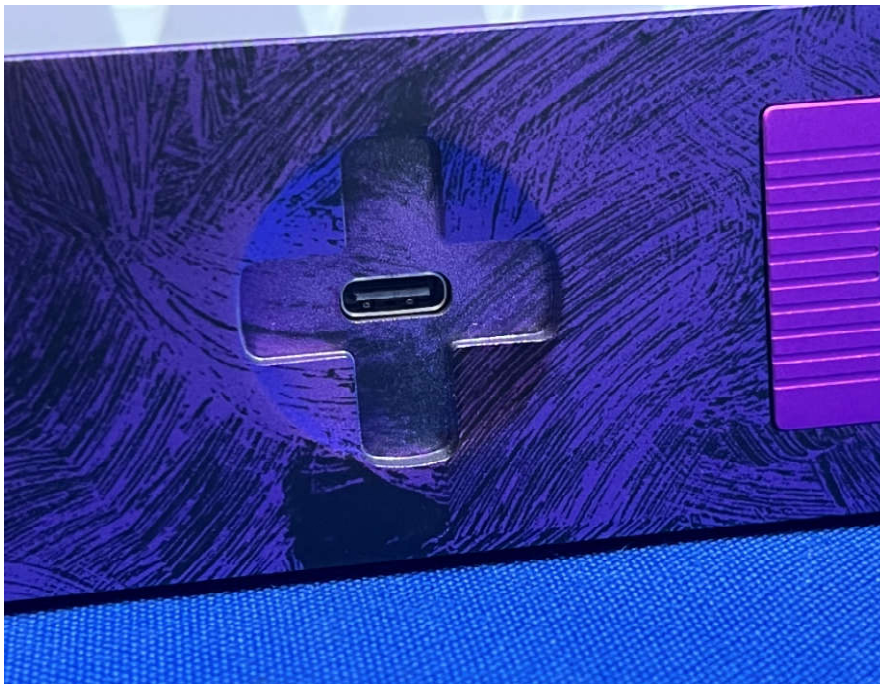
View of Product-07