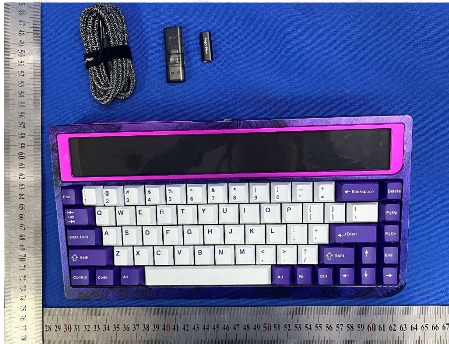
View of Product-01