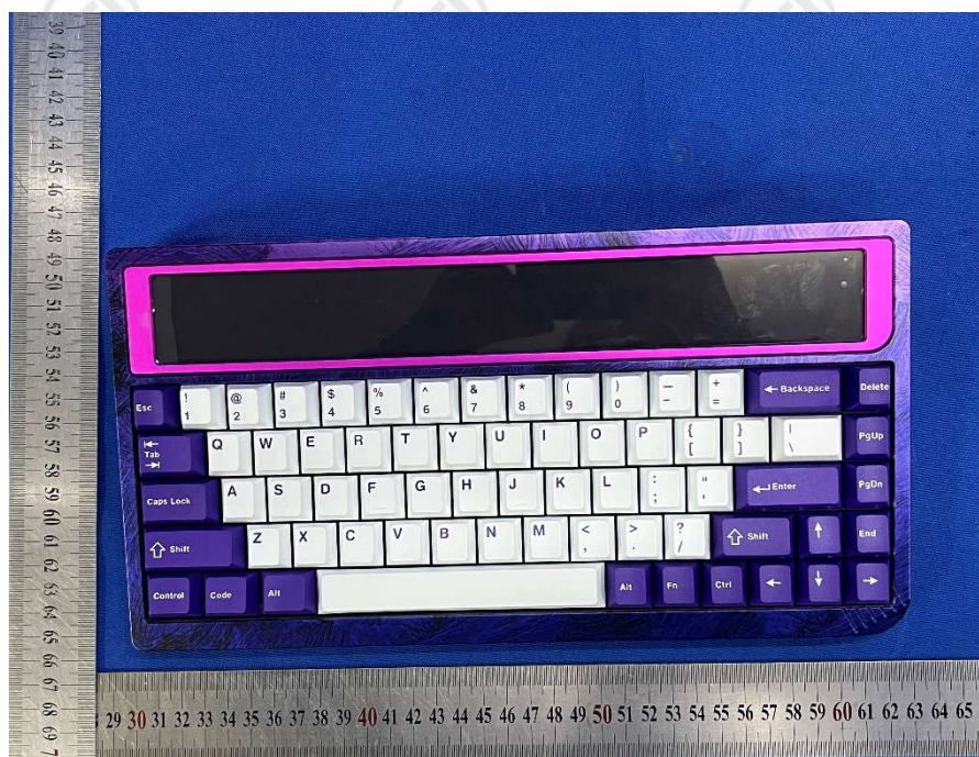
View of Product-02