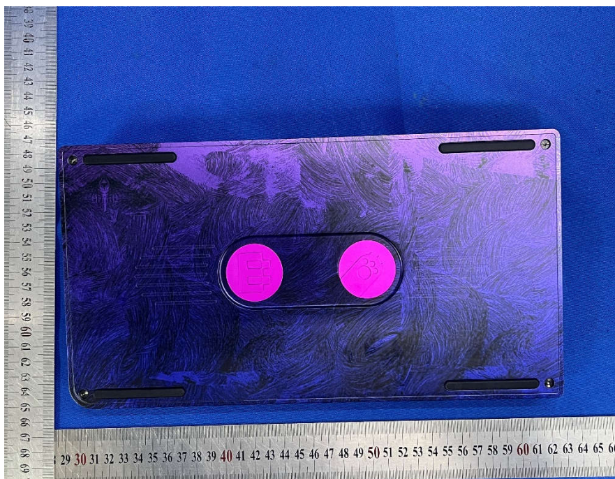
View of Product-03