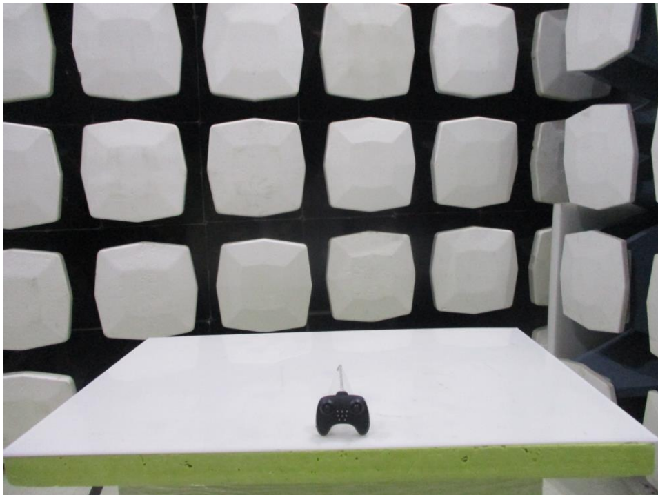
Up to 1GHz (EUT was placed in the centre of the turntable)