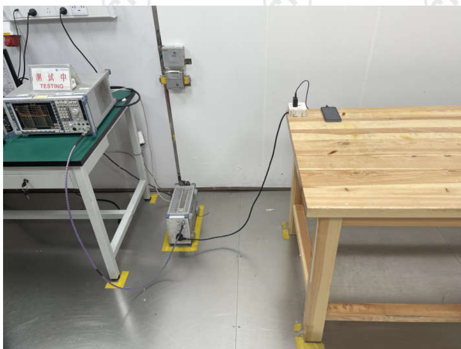
AC Power Line Conducted Emission