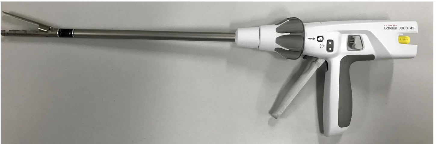
Figure 5: Echelon 3000 Side 2