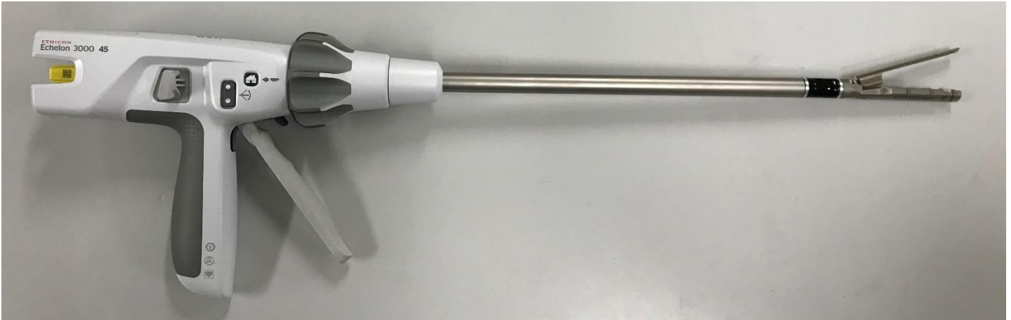
Figure 1: Echelon 3000 Side 1