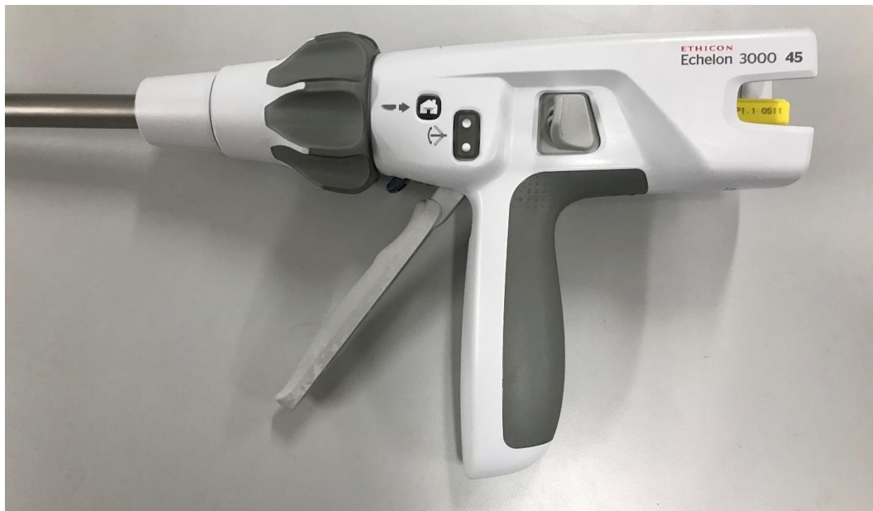
Figure 7: Echelon 3000 Side 2 Shroud Close Up