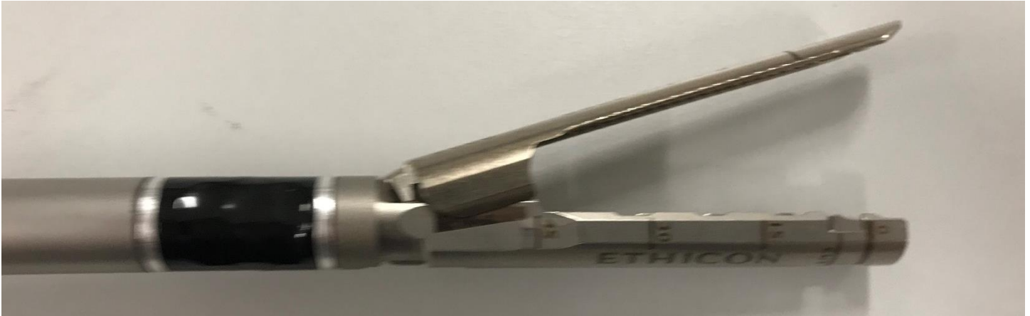
Figure 3: Echelon 3000 Jaw Close Up