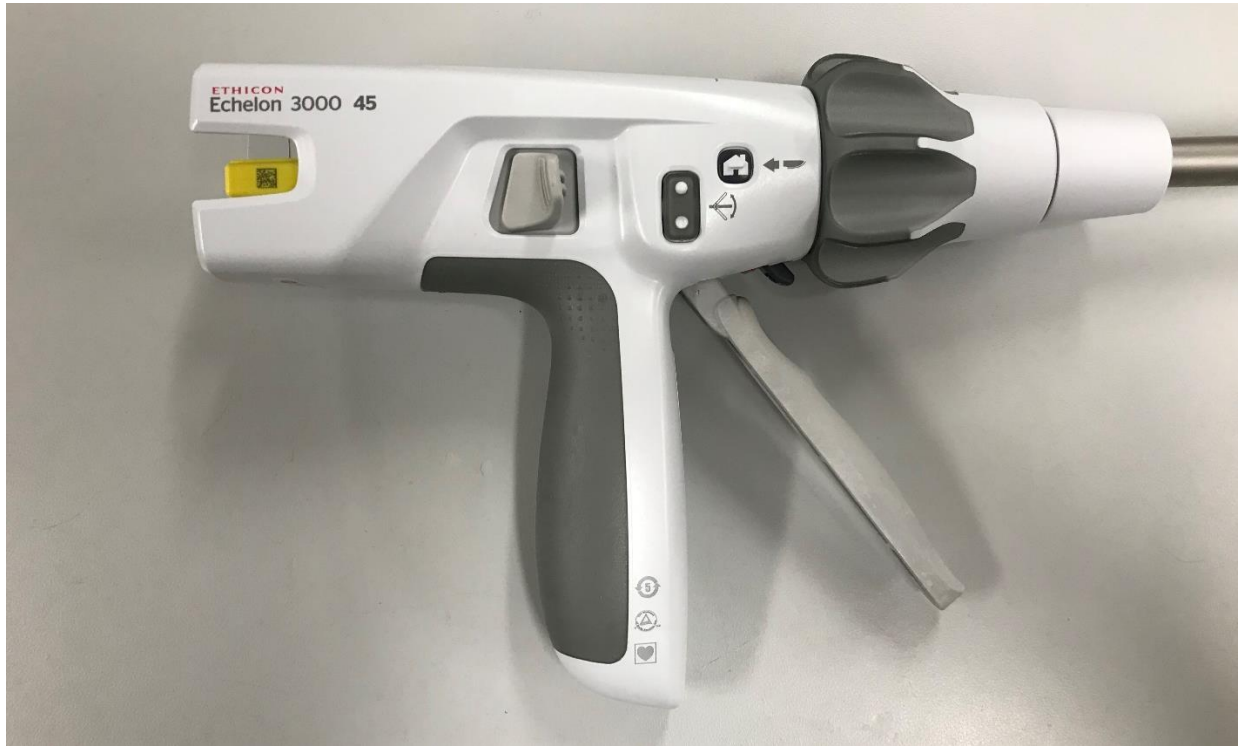
Figure 4: Echelon 3000 Side 1 Shroud Close Up