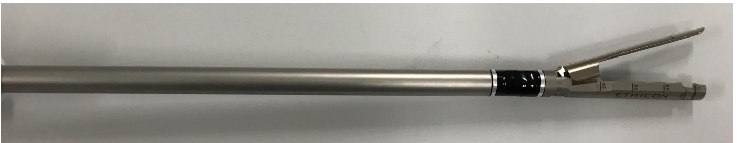
Figure 2: Echelon 3000 Shaft Close Up