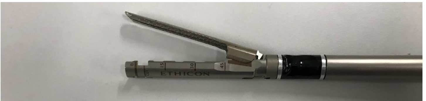
Figure 6: Echelon 3000 Jaw Side 2 Close Up