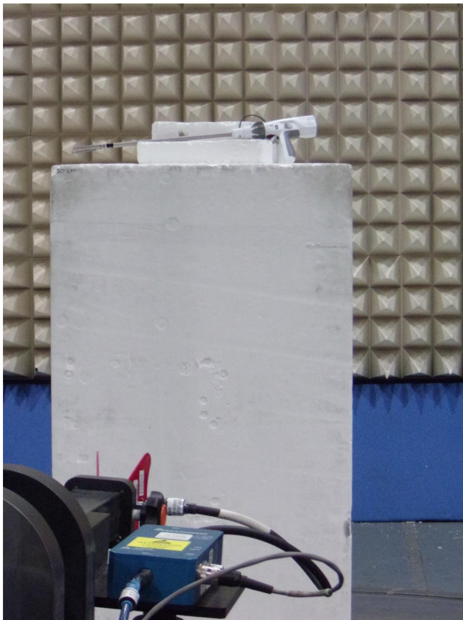
Figure 4 Radiated spurious emissions, 18GHz – 40GHz