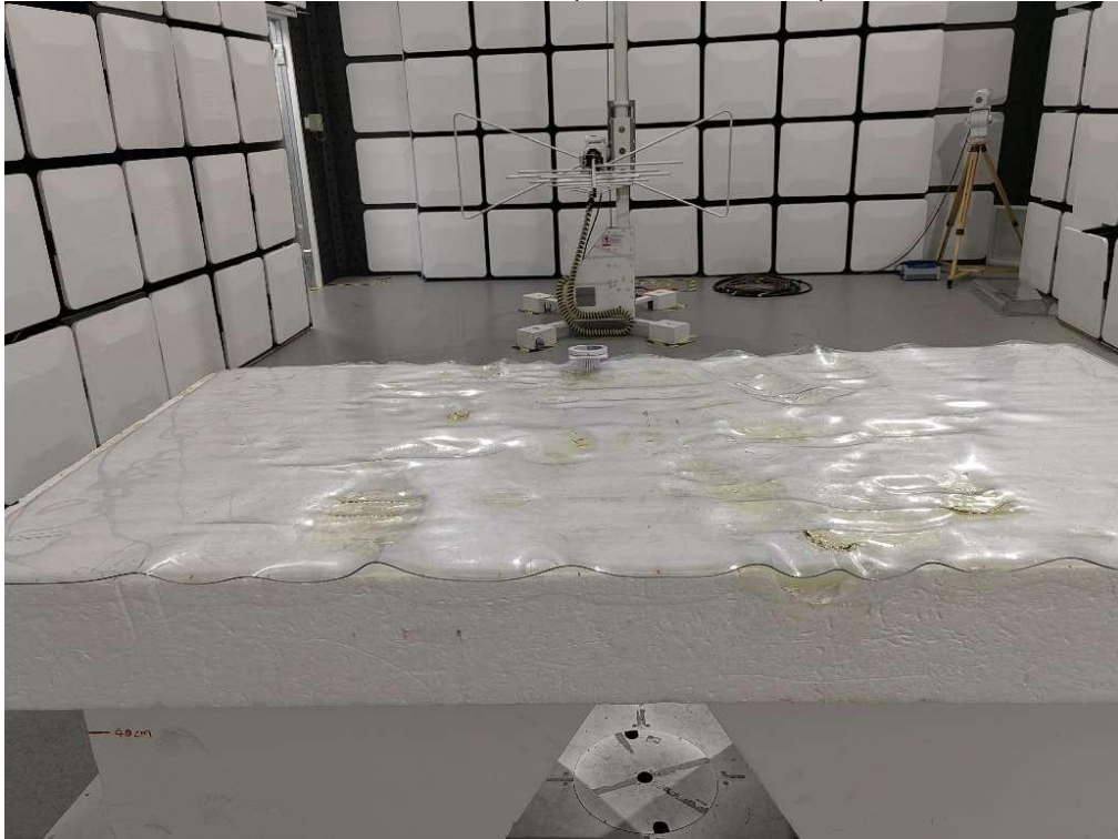
Radiated Emissions (Above 1GHz)