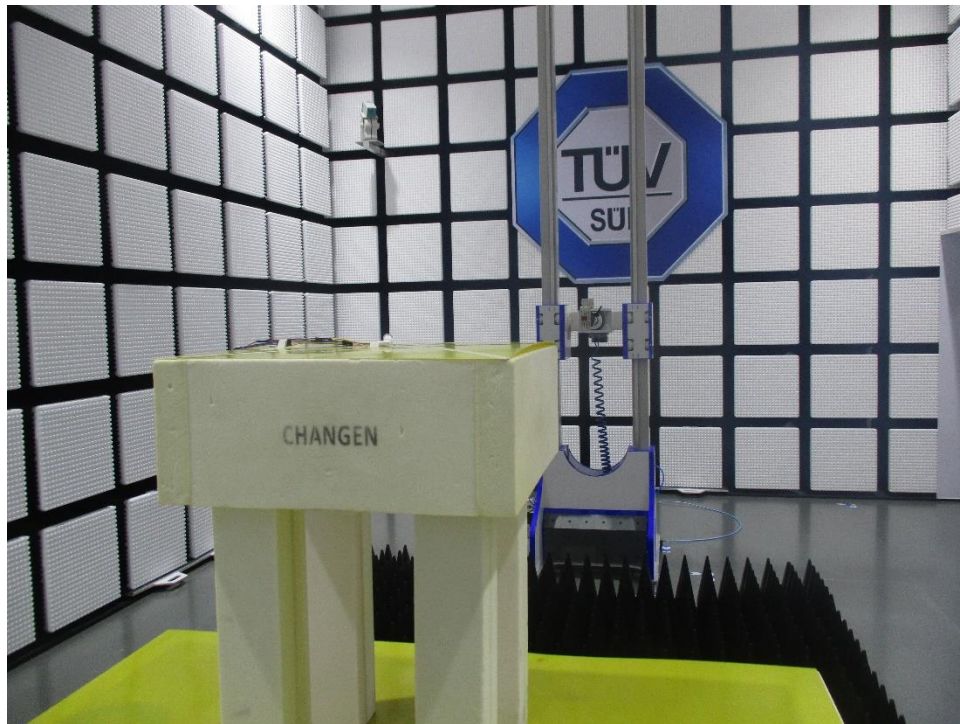
Test Setup for 18GHz to 40GHz