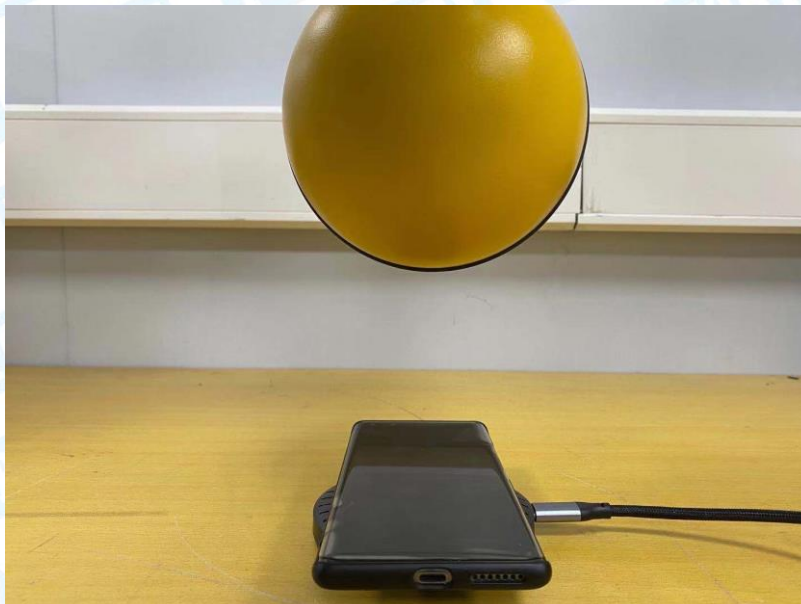
Test Set-up Photo