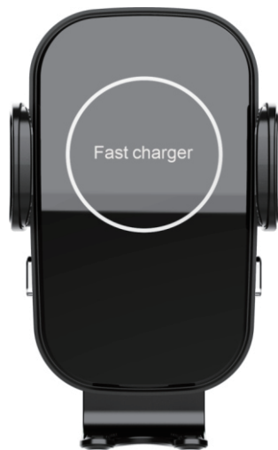
Full-automati Car Wireless Charging