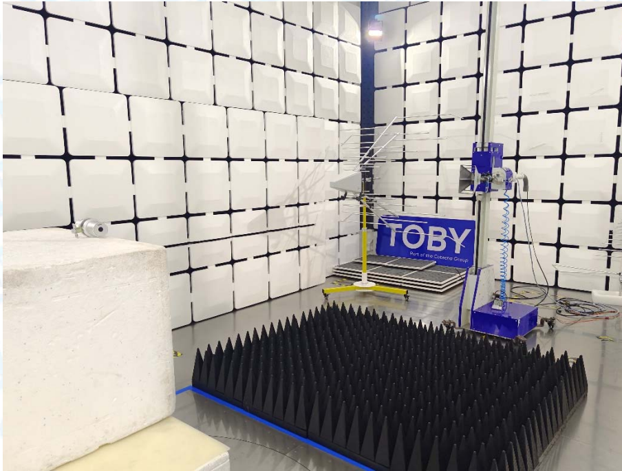
Photo of Setup for Conducted Emission