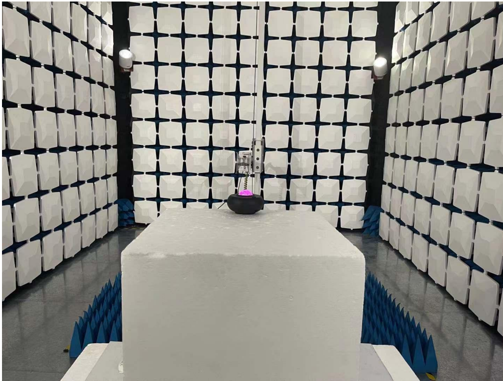
Below 1GHz for radiated emission test setup