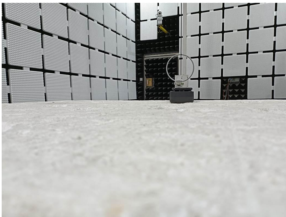
Radiated Emission below 30MHz-AC adapter charge mode