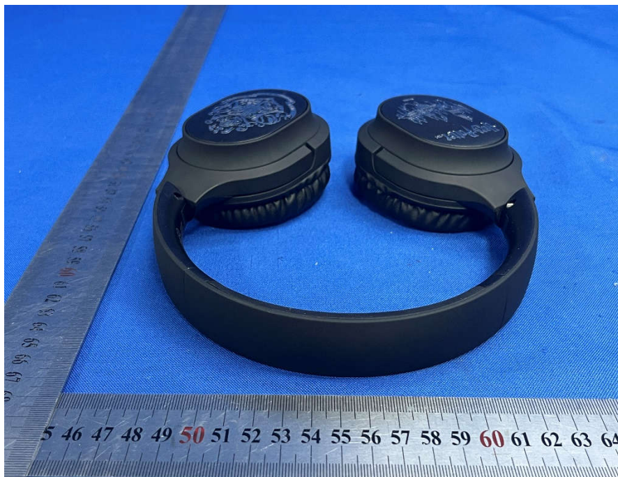
View of Product-03