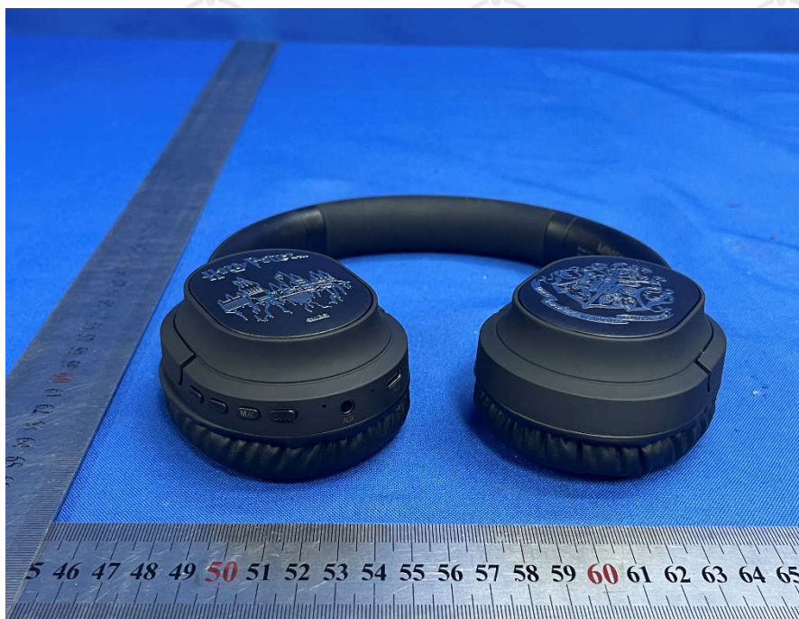
View of Product-06