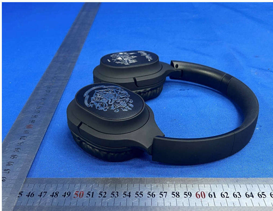
View of Product-05