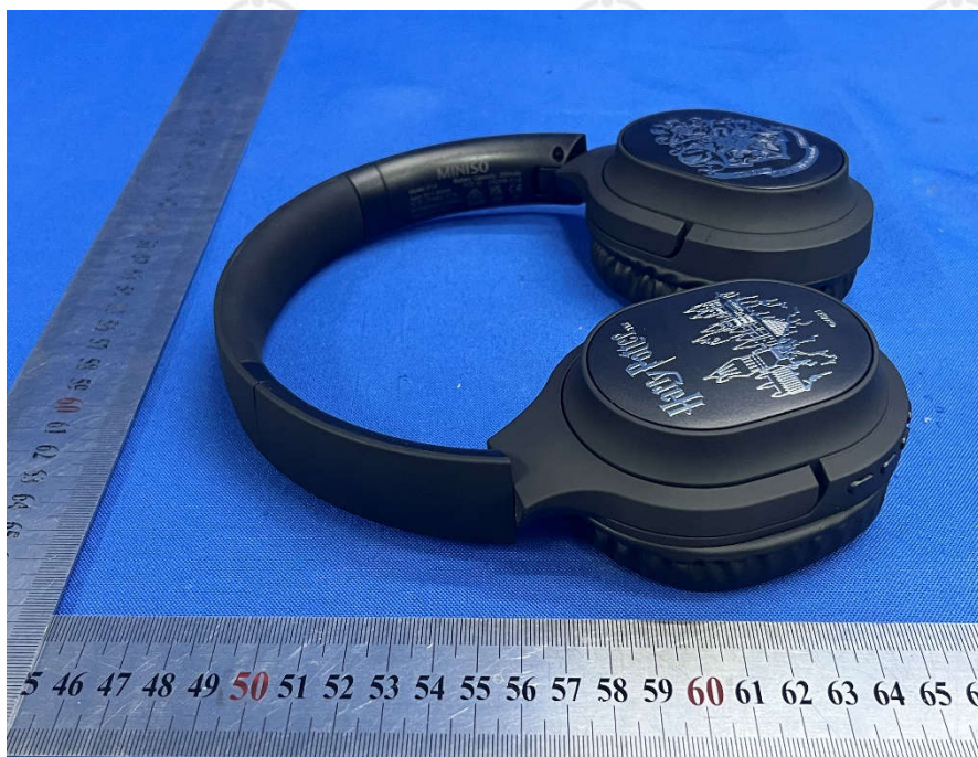
View of Product-04