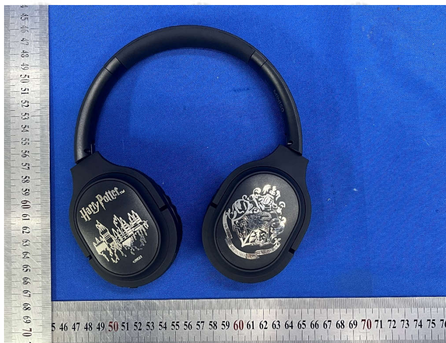
View of Product-01