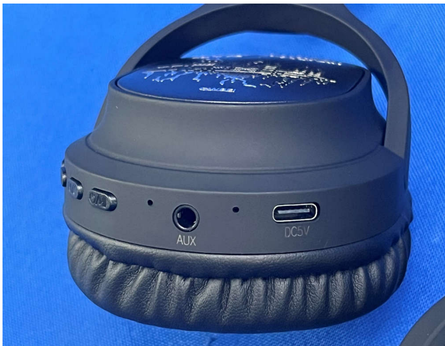
View of Product-07

The test report is effective only with both signature and specialized stamp, The result(s) shown in this report refer only to the sample(s) tested. Without written approval of CTI, this report can't be reproduced except in full.