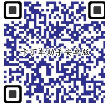
For Google Play doanload