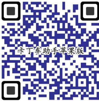
For IOS download