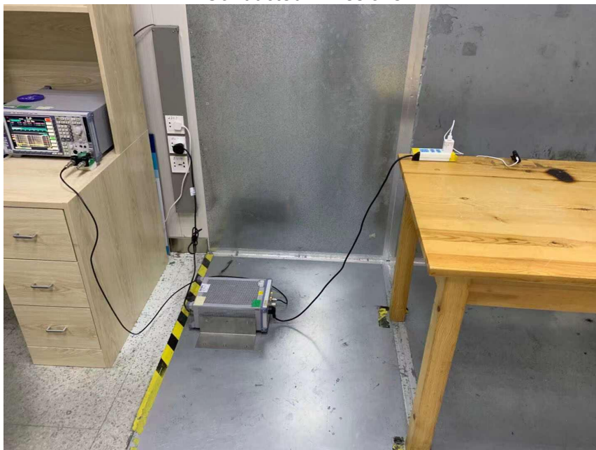
Radiated Spurious Emissions From 30M-1GHz