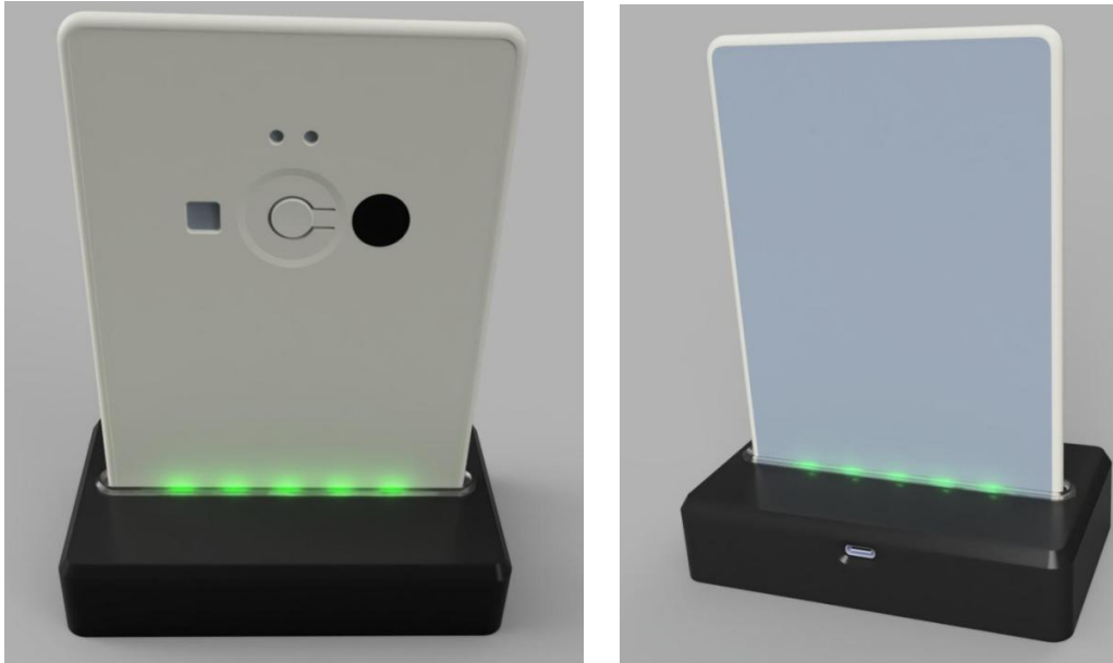
Image 5. Charging using a docking station

The device can also be charged using a docking station which has USB-C plug.